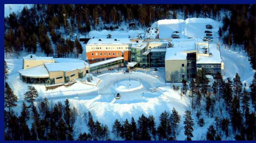
Space Campus, Kiruna